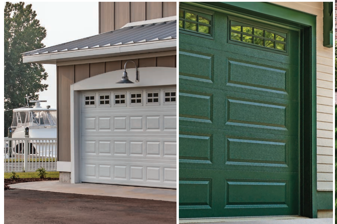
Short Raised Panel, Model 2241 shown in white with optional stockton window inserts.

Long Raised Panel, Model 4216 shown in evergreen with optional cascade window inserts.